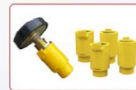
Standard double-screw rubber pad ( pin dia 1/2" ) with 3" extension adapters.