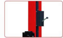
Single point safety release makes it easier for operators to unlock both columns from one column.