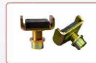
The optional saddle adapter. Kits No.:1102185006C