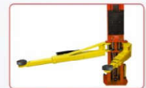
SuperAsymmetric arms allow to load different vehicles in an asymmetric or symmetric configuration.