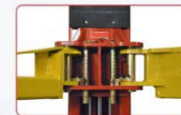
Automatic arm restraints