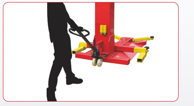
"Pallet jack"style device allows the lift to be moved wherever you need it.