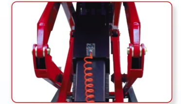
Automatic safety release.