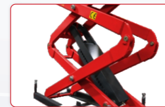
Strong tubing makes the lift safer and more durable than the competition.