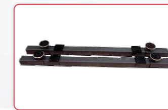
Leveling bar kits No.: SX003