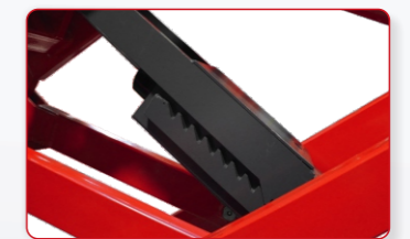
Mechanical Safety Locks.